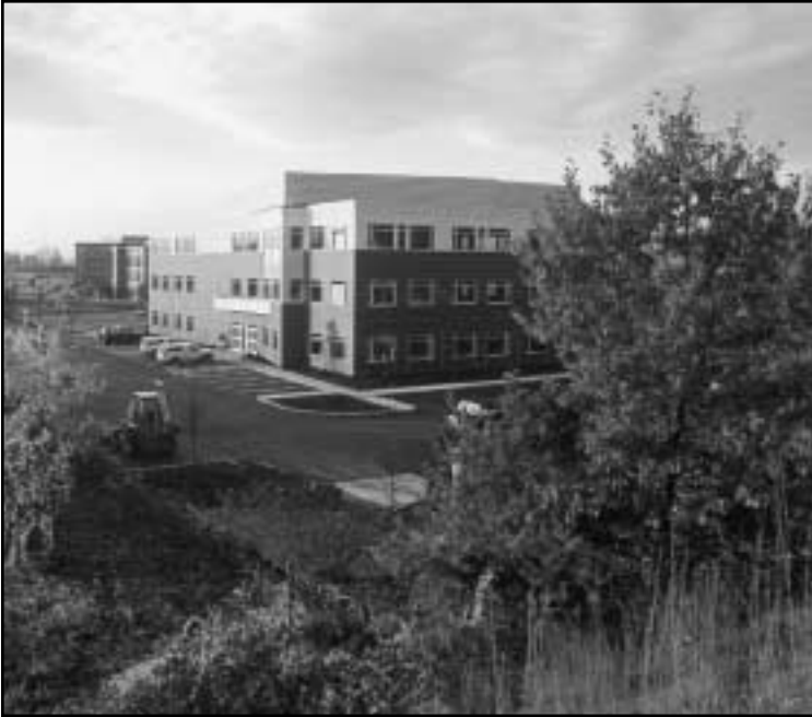
New England Dental Administrators, Two Delta Drive, Concord, New Hampshire

On November 11th, NEDA moved to a brand new building located at Two Delta Drive. The new space allows us to serve you better while providing NEDA with expansion opportunity. While our street address is changed from One Delta Drive to Two Delta Drive, our PO Box, telephone numbers, and zip code remain the same.